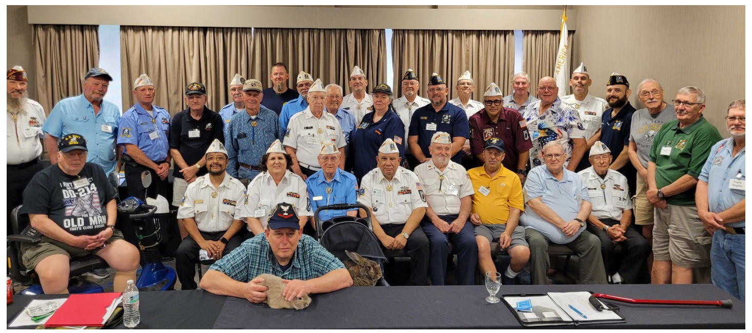
Group picture of most of the attendees at the 2024 Convention business meeting at the end of the day. They are a good looking bunch. Many participated in the meeting and nobody was bloodied. The Convention meeting notes can be found on the NSVA Website at <a href="https://www.nsva.org">www.nsva.org</a>

The SVAA was in-charge of the hospitality room, the refreshments, and snacks. They also organized the auction items, table games and maintained the room in a neat and orderly fashion. A Thank You to the Auxiliary and the other NSVA members and guests that contributed both their auction items and energy in making this convention a success.