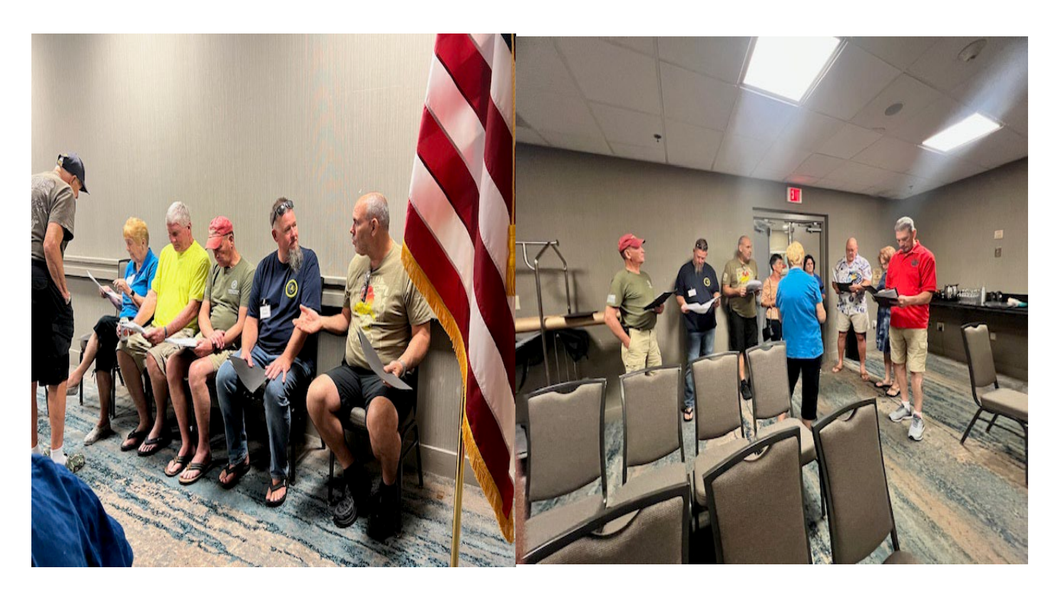
Reader practice for the Memorial Service held on Saturday morning. It is a very moving and solemn ceremony. As mentioned in the Chaplains Corner 155 names where read.